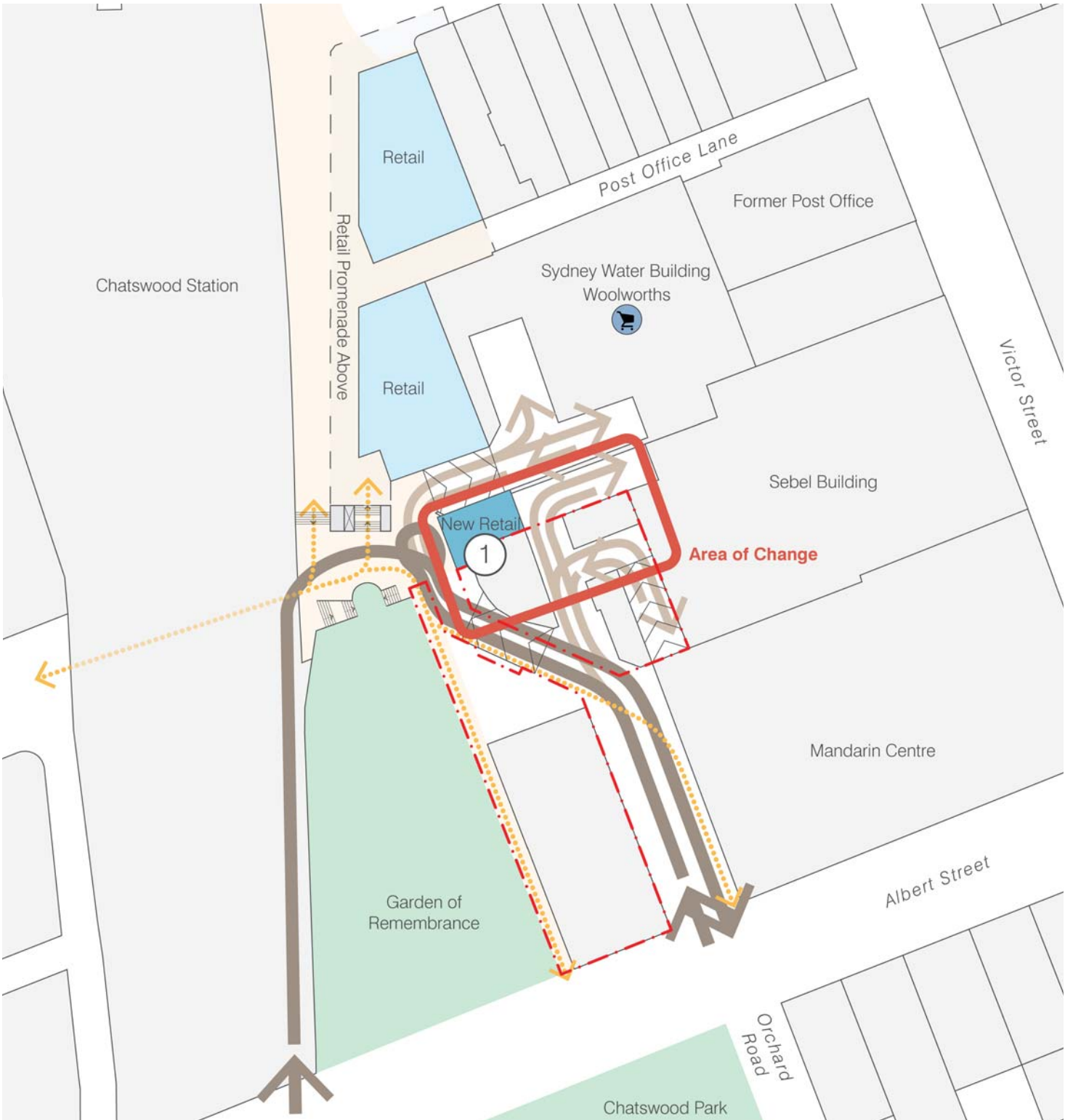
Proposed Arrangement Plan