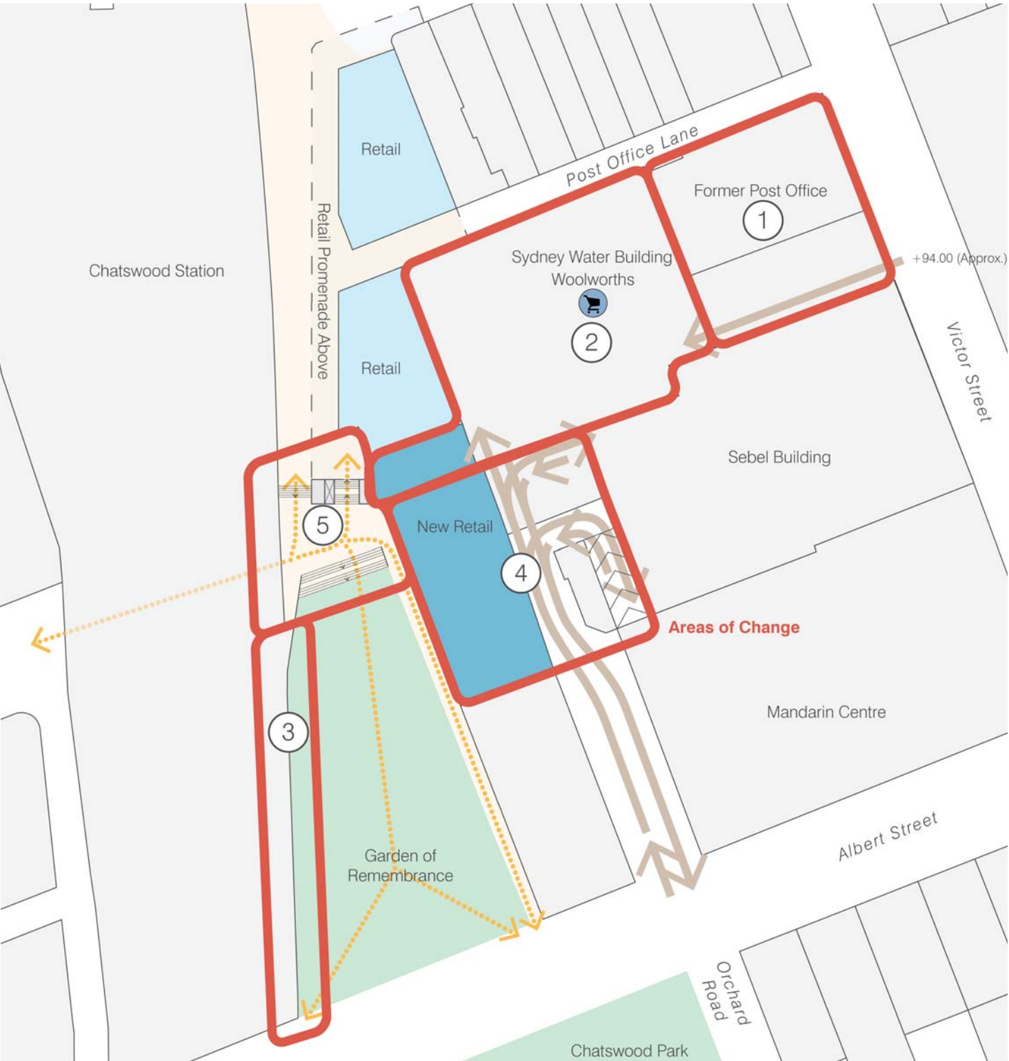
Long Term Arrangement